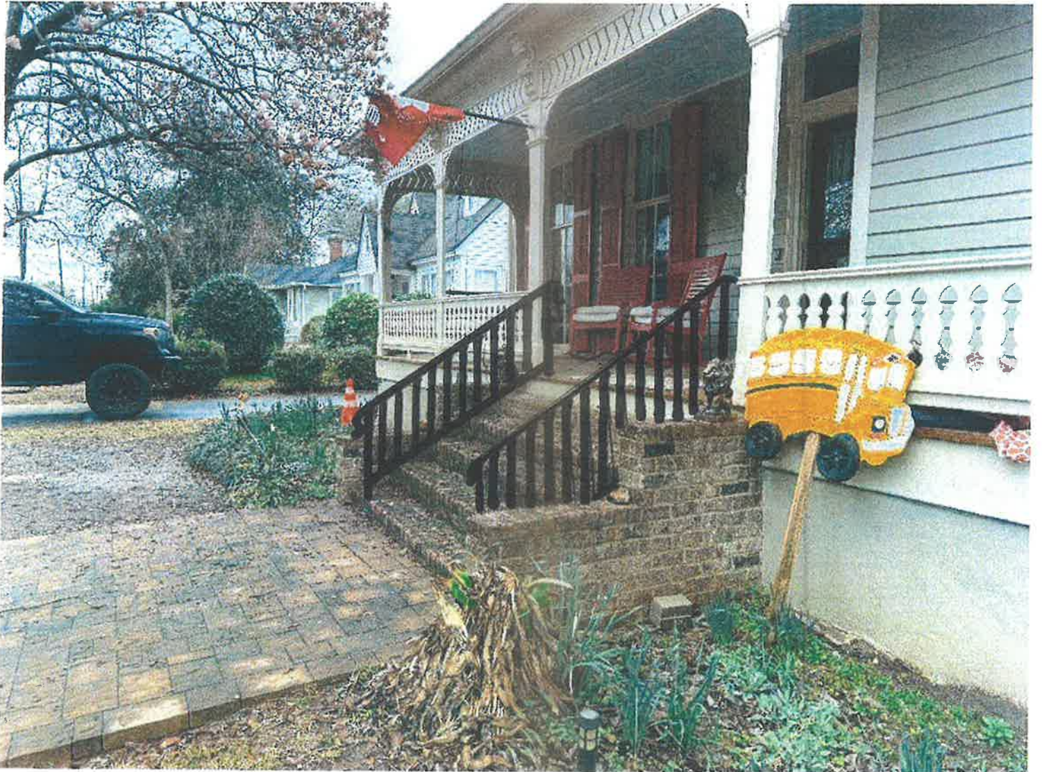
Cream color to blend with porch